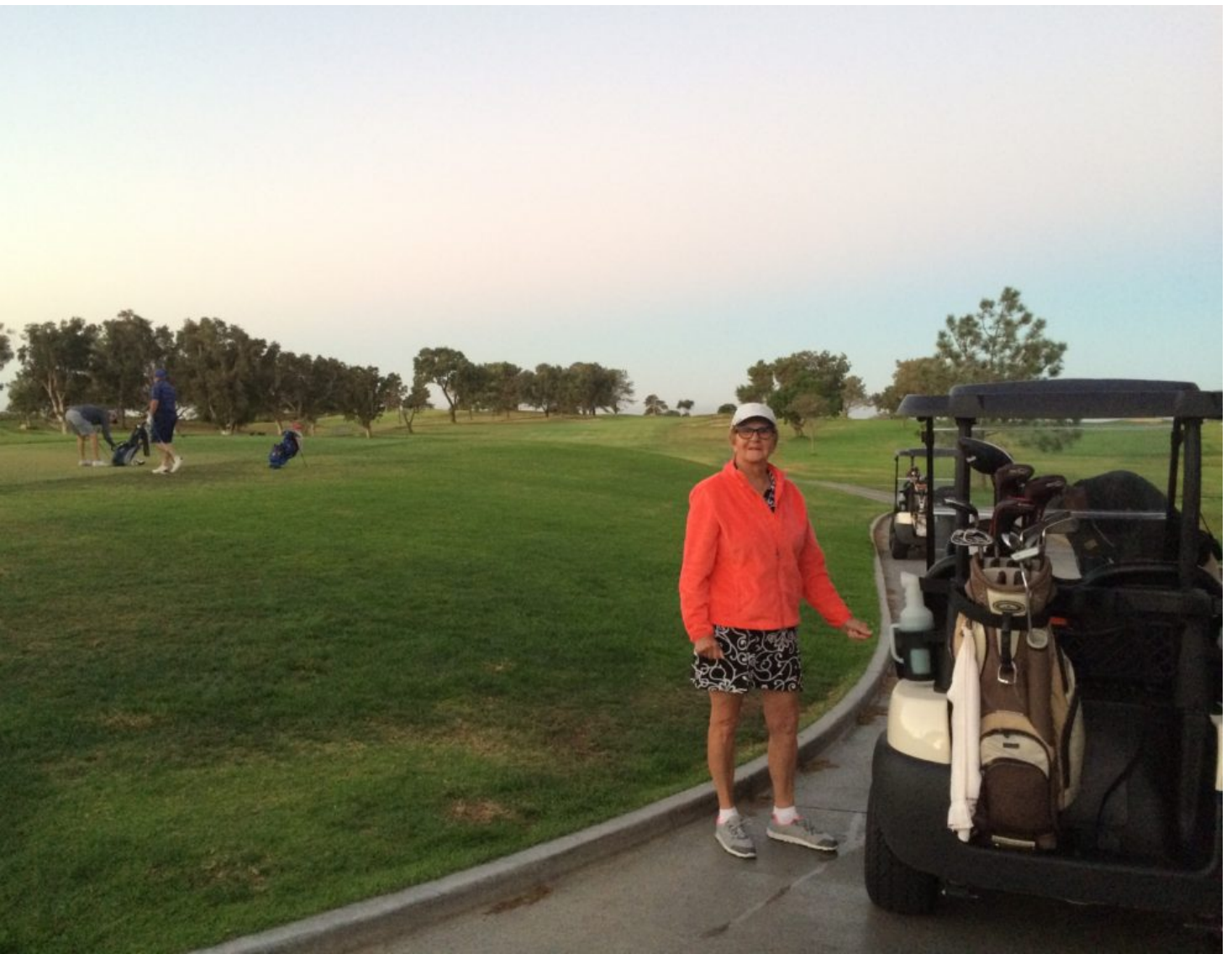
dy, set, GO